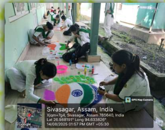
Rangoli Competition of Pre Independence Day celebration, 2025