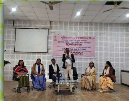
MULAKAT Programme by Sahitya Academy