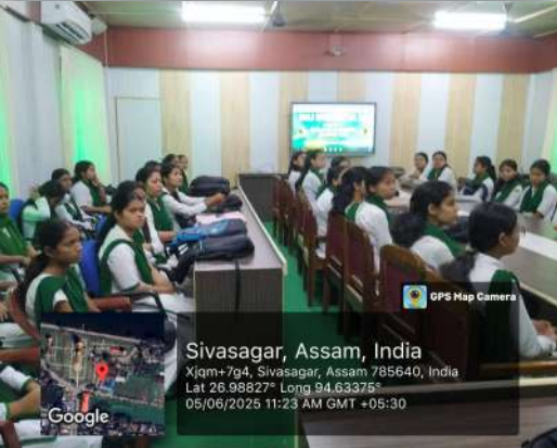
Celebration of World Environment Day, 2025