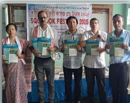
SGC Book Fest 2025 & unfurling of Library Newsletter