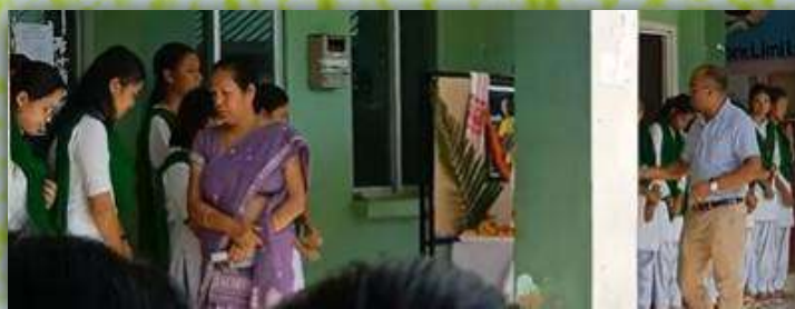
প্ৰাণৰ শিল্পী জুবিন গাৰ্গলৈ শ্ৰদ্ধাঞ্জলি