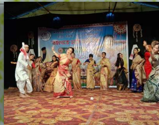
বহাগতে মাৰি যাওঁ বিহু শীৰ্ষক বিহুৰ অনুষ্ঠান