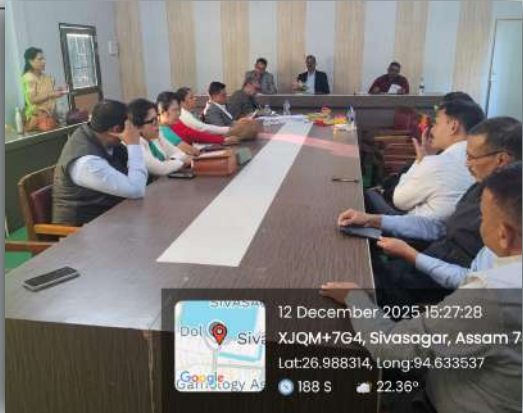
Academic Audit for NAAC