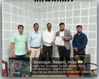
MOU with PIBM, Pune