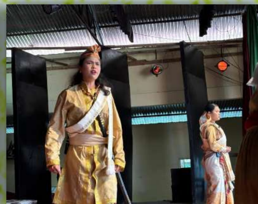
ছাত্ৰীসকলৰ দ্বাৰা সতী জয়মতী নাট মঞ্চস্থ