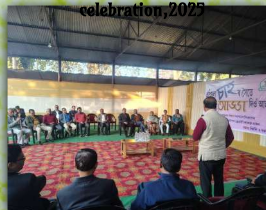
“এপিয়লা চাহৰ সৈতে আড্ডা” নাগৰিক অনুষ্ঠান