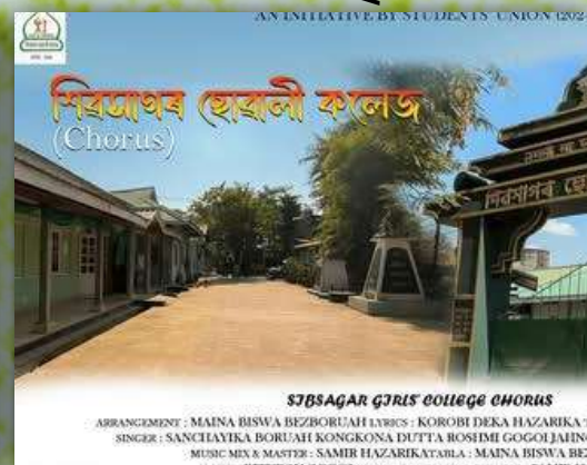
কলেজ সংগীতৰ দৃশ্যশ্ৰাব্য সংস্কৰণ মুকলি