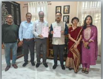
MOU with S.P.P. College, Nanti