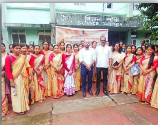
45-day training programme of Weaver's Service Centre, Guwahati