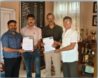
MOU with National Skill Academie, Guwahati