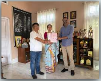
MOU with Skyline Institute of Geo-informatics, Guwahati