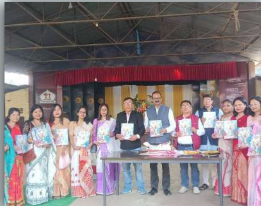
কলেজ আলোচনী প্রবাহিনী ২৪-২৫ উন্মোচন