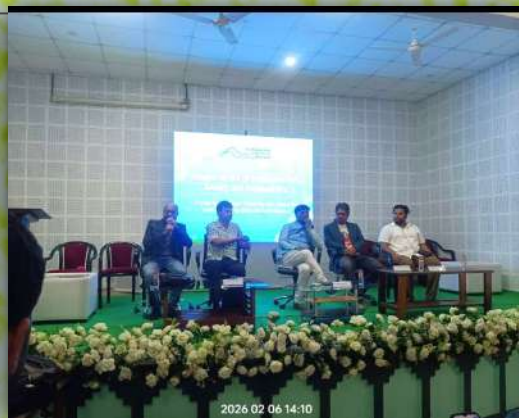
Brahmaputra Literary Festival 2026