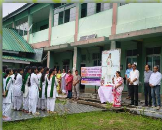
ভূপেন হাজৰিকাদেৱৰ জন্ম শতবৰ্ষ শ্ৰদ্ধাঞ্জলি অনুষ্ঠান