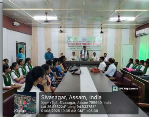
Induction Programme for Four year integrated teacher education program (ITEP)