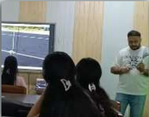
Drone Technology Workshop