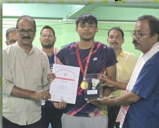
D.U. Inter College Badminton Tournament