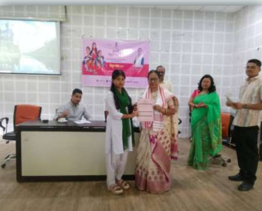
মুখ্যমন্ত্রীর নিযুক্ত মহিলা আঁচনিৰ শুভাৰম্ভ অনুষ্ঠান