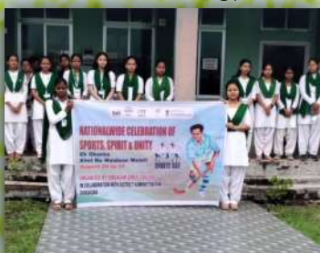
National Sports Day 2025